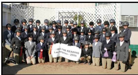
Riding For Reading's Los Angeles Class - 2006

T he Riding For Reading Class is the flagship activity of Riding For Reading. This unique class allows riders from 1 st through 12 th grade to represent their schools and to win grant money for their school's library. Because of the flexible structure of the class, it is available to English, Western and Dressage styles of riding and competition.