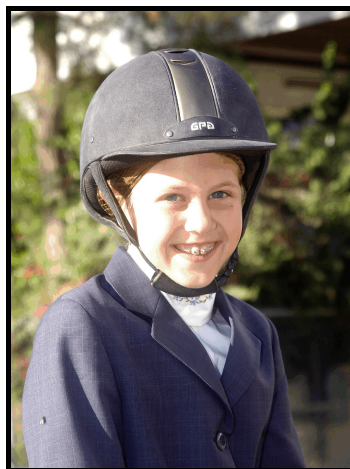
All smiles in Riding For Reading!

480 W. Riverside Drive Suite 1 Burbank, CA, 91506 818.563.3250 ext. 6 www.ridingforreading.org ridingforreading@aol.com