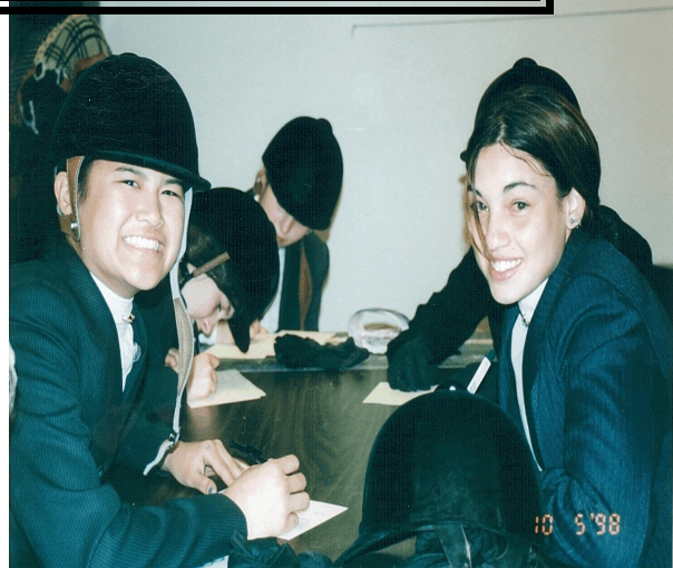
...and having fun!