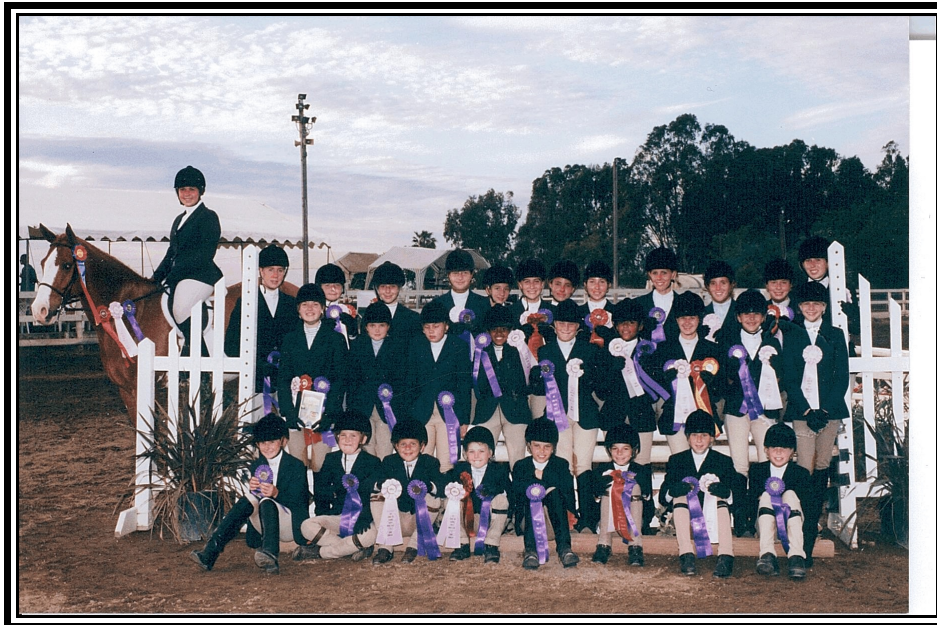
Child Mount Class of 1998 (Sacramento, California)

Every rider who participates... and schools win too!