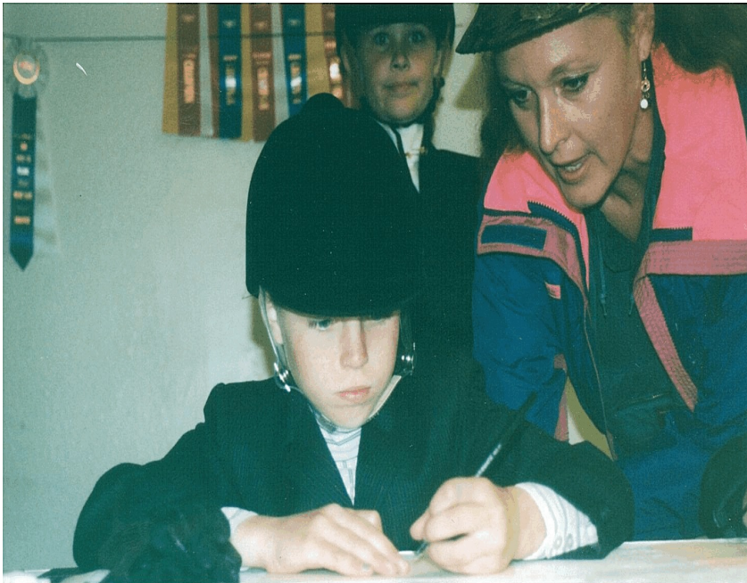
Writing thank you notes...

the Riding For Reading Class, all of the riders write thank you notes to the many sponsors and supporters of Riding For Reading.